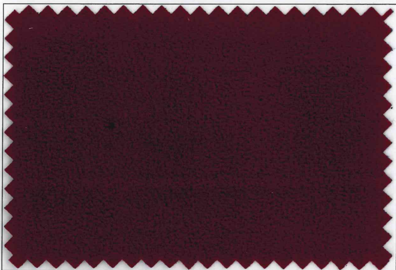
Prism - 15 oz. Shown in Cabernet