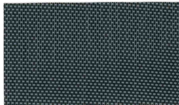
10% 030001 | Charcoal/Grey