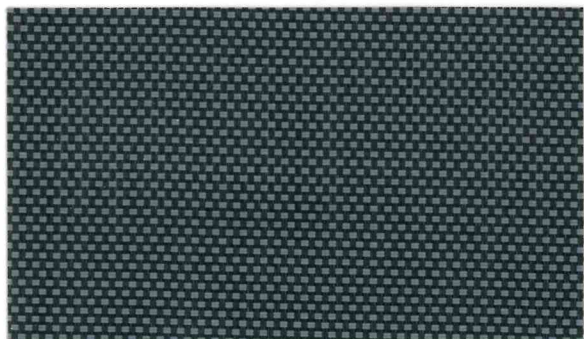
5% 030001 | Charcoal/Grey