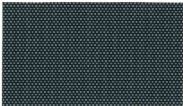
1% 030001 | Charcoal/Grey