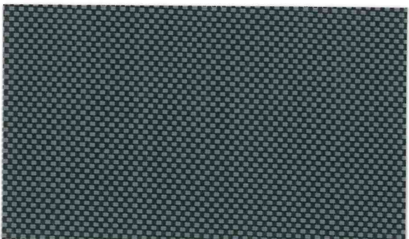
3% 030001 | Charcoal/Grey